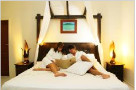
Deluxe Beachfront Interior