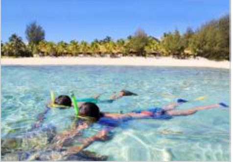
Stunning Beach Location

Crown Beach is a perfect choice for those wanting to experience unparalleled luxury, privacy and pure indulgence.