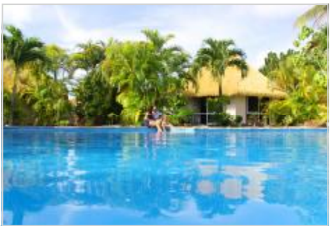
Relax By The Pool....