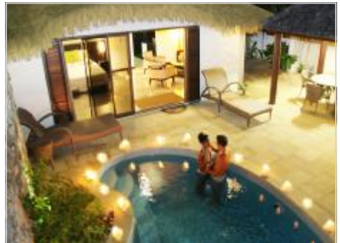
Courtyard Pool Suites - perfect for romance...