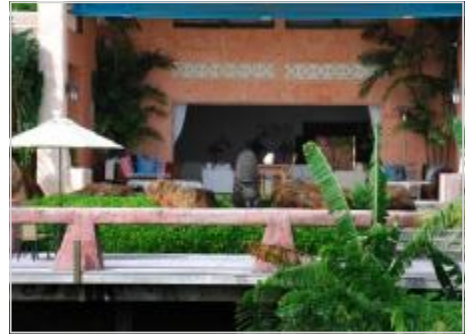
Your Villa awaits you...