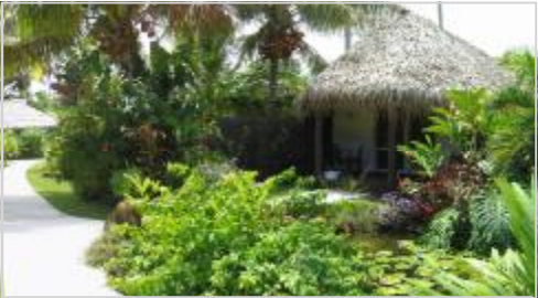
Lagoonview Villa 6