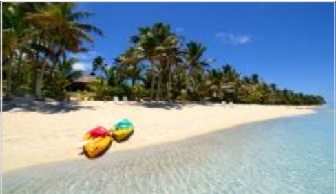
Royale Takitumu Beachfront

Honeymooners and Wedding Couples will enjoy this quiet retreat and the pampering service from the very friendly staff.