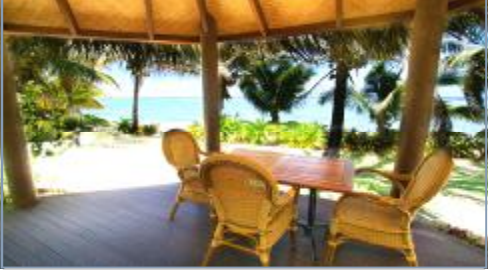
Honeymoon Beachfront Villa