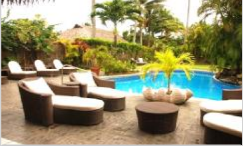
Relax & Unwind by the pool day or night